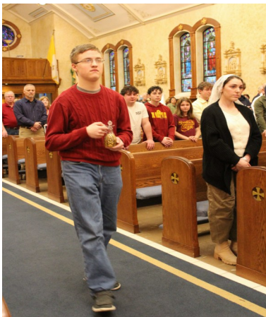
Holy Thursday - presenting Holy Oils